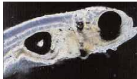
Figure 5. At the swim-up stage, larval sunfish must switch from obtaining food from their yolk sacs to obtaining food from the environment.

sacs for nutrients and energy to obtaining food from the environment. During this stage, nutrients from the yolk sac are depleted and the larva's mouth becomes more fully developed (Fig. 5). Larvae will