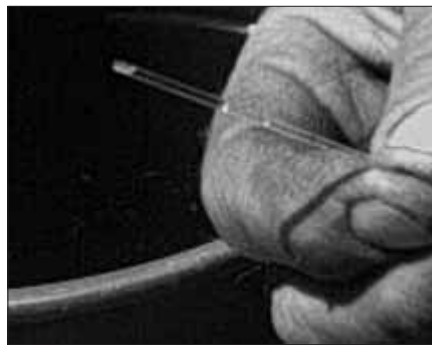
Figure 3. Inserting a capillary tube into the sunfish urogenital opening to retrieve eggs is the most reliable method for sexing adult fish.

urogenital sinus, angle it back toward the tail and slightly to one side. Then, gently push the tube through the oviduct and into the ovary. Use gentle force while slightly twirling the capillary tube back and forth. When the tube is inserted, place a finger over the end of the tube and remove it. If eggs are seen in the tube, the fish is a female. If no eggs are present and no milt was expelled, then sex cannot be determined and the fish should not be used.