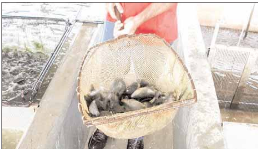
Figure 6. Harvesting hybrid sunfish from cages and recirculating systems is relatively easy.

There is no standard method for processing sunfish. Processing methods vary by location and social culture. After scaling, fish may be processed in-the-round (eviscerated or head removed and eviscerated) or filleted (skin on or skin off).