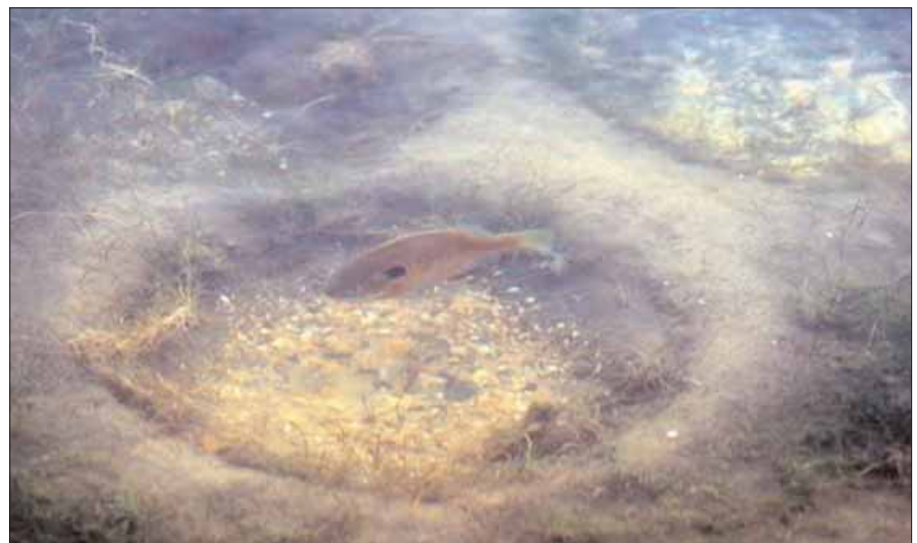
Figure 1. Sunfish are colonial nesters, constructing nests in densely packed clusters. After spawning the male sunfish defends the nest and cares for the eggs.

However, widespread introductions have increased the ranges of these sunfish throughout the country. The first researchers observed the basic biological activities of sunfish. These early studies found that all sunfish begin spawning in late spring or early summer and most continue spawning until early fall. Male sunfish usually appear first at the spawning sites. Males construct nests in shallow water by sweeping a depression in the sand or gravel. Sunfish are colonial nesters, with nests in densely packed clusters (Fig. 1). A male circles its nest and produces courtship calls consisting of a series of grunts. When a female is attracted to the nest, her