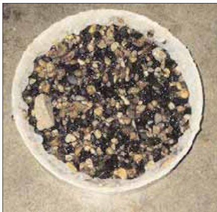
Figure 4. Removable artificial substrates can be used during induced spawning of sunfish.

ature and photoperiod to induce spawning. Fish are held in tanks at a male-to-female ratio of 1:2 to 1:4. Removable artificial substrates are placed in the tanks for spawning (Fig. 4). The artificial nest pictured was made by removing the bottom 2 inches (5 cm) from a 5-gallon (19-L) plastic bucket and adding loose pea gravel to the bottom.