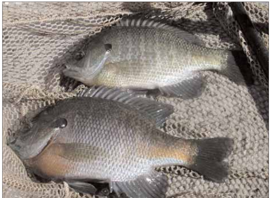
Figure 2. Sunfish are more easily sexed during the breeding season. The male bluegill (below) tends to be larger than the female (above) and takes on distinctive spawning colors.

sary for a positive identification. First, use gentle pressure on the abdomen, moving from the middle of the abdomen back to the vent. If milt (white liquid) is expelled from the urogenital opening, the fish is a male. If no milt appears, the fish is probably a female but positive identification requires a capillary tube. A 0.04- to 0.05-inch-wide (1.1- to 1.2-mm) and 2- to 4-inch-long (5- to 10-cm) capillary tube should be used. Hold the fish upside down and gently insert the capillary tube through the urogenital opening (Fig. 3). Once the capillary tube is inserted into the